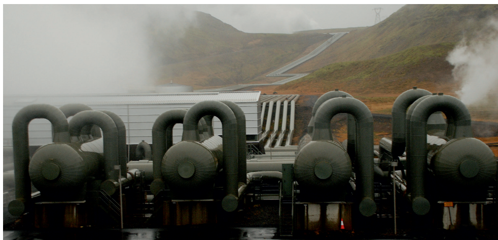
Photo 2. Hellisheiði Geothermal Power Station, Iceland

GE is often presented to the public as almost without any substantial environmental impacts, apart from direct modifications of the physical landscape with construction. However, its landscape impacts related to environmental issues are considerable too (KRISTMANNSDÓTTIR, H. and ÁRMANNSSON, H. 2003). Especially the use of high-enthalpy fields entails a range of negative consequences, some of which can affect landscape quality in a less direct way. Stability of hillsides can be weakened by thermal changes in the soil and landslides have oc-