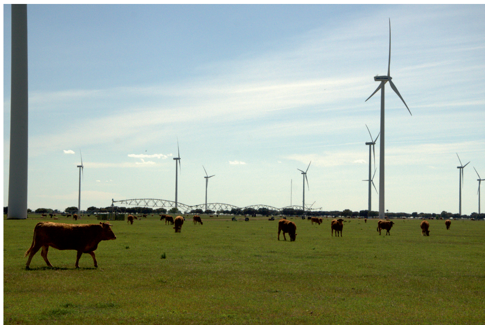
Photo 1. Wind farm “San Lorenzo”, Castilla y Leon, Spain

factors, such as night lights, shadow flicker and the stroboscopic effect (KIL, J. 2011).