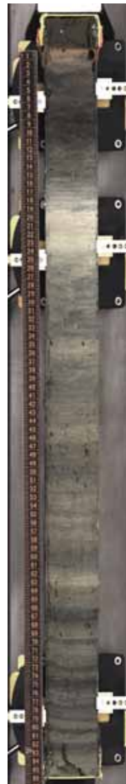
Fig. 2: A sediment core is retrieved from Lake Joux. The different layers are clearly visible in the JOU14-01 core cross section on the right.