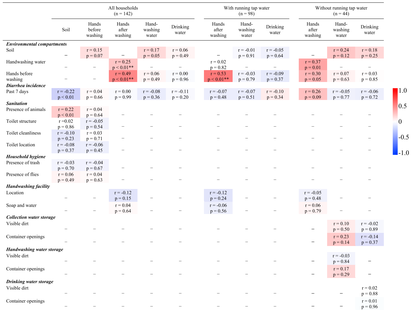
FIGURE 2. Correlation matrix for Escherichia coli levels in soil, hands (before and after washing), and water (drinking and handwashing) for all households as well as households with and without running tap water. Spearman rank ( r ) and P values are shown for the correlations included in the analyses. The scale bar shows the correlation coefficient (Spearman rank). Red represents positive correlations and blue represents negative correlations. For interpretation of the references to color in this figure legend, the reader is referred to the web version of this article at www.ajtmh.org .

were analyzed separately for handwashing water, drinking water, and hands after washing in households with and without running tap water. The correlations for soil and hands before washing were only performed for all households. Figure 2 shows the correlations included in the analyses for E. coli levels in soil, hands (before and after washing), and water (drinking and handwashing) for all households as well as households with and without running tap water. A Holm–Bonferroni correction was applied to control the family-wise error rates for significant correlations. 49 The adjusted P value for Holm–Bonferroni corrections are reported as adj. P . The strength of Spearman \rho correlations was interpreted as weak ( r_s < 0.20 ), moderate ( 0.20 < r_s < 0.50 ), or strong ( 0.50 < r_s < 0.80 ). 50 Multivariate regression analyses investigated associations between environmental compartments and household-level characteristics (from surveys and observations) based on the conceptual framework (Figure 1, Table 3). Specifically, five independent models were designed to assess associations for soil, hands (before and after washing), and water (drinking and handwashing) for all households. In