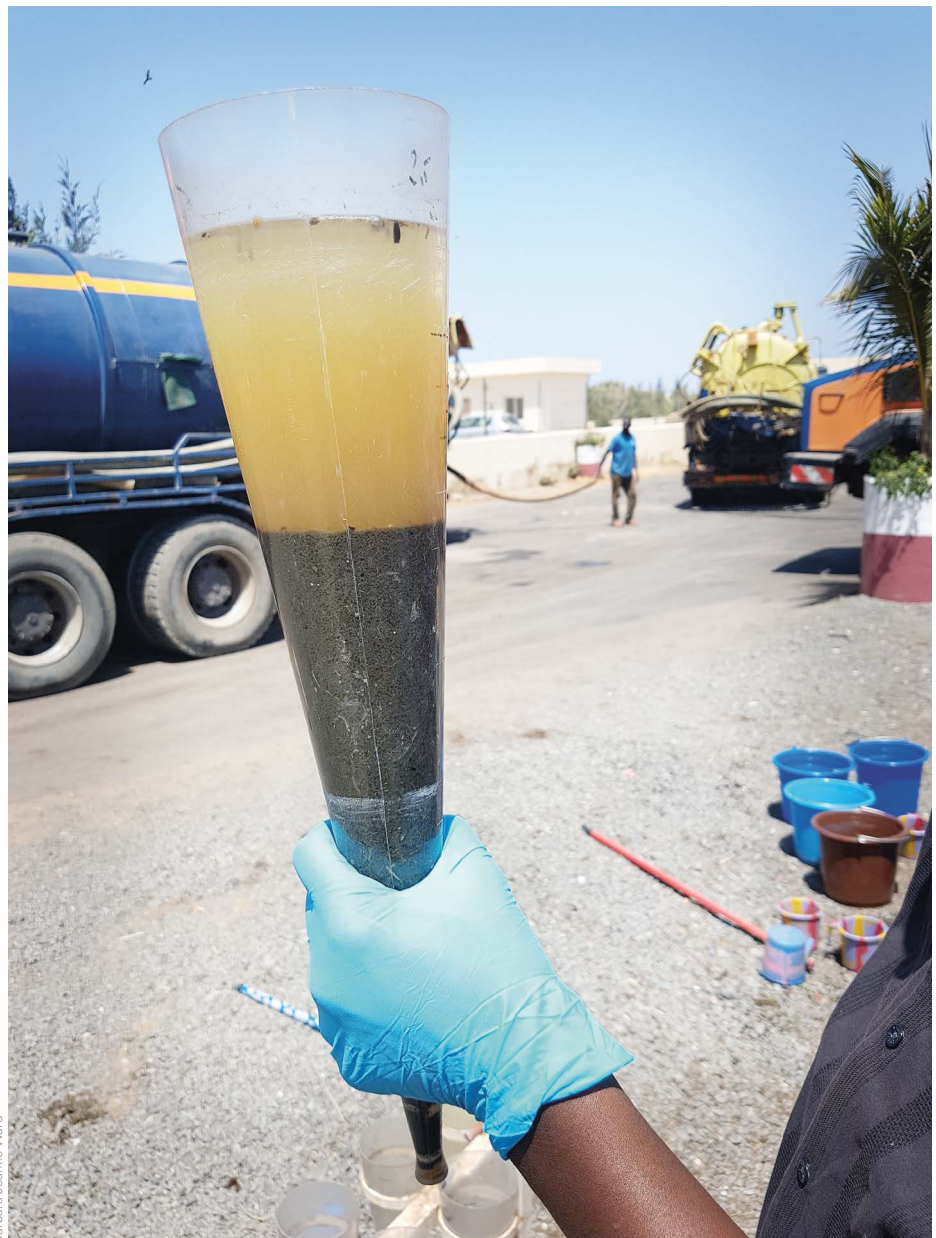
Photo 1: Settling tests on conditioned faecal sludge in Dakar, Senegal.

Conditioners are chemicals that facilitate rapid coagulation and flocculation of particles, which induce more complete settling and faster dewatering. Introducing conditioners has the potential to revolutionise the management of faecal sludge, if it can be determined how to use them reliably. Furthermore, this can lead to improvements in the effluent quality from settling-thickening tanks and reduce dewatering and drying time on drying beds, which can increase the treatment capacity of existing facilities. Conditioners are necessary for many low-footprint dewatering technologies. For example, mechanical dewatering technologies, such as belt and filter presses, and passive dewatering technologies, e.g. geotextile bags that rely on filtration to separate solids from liquids, only work with the addition of conditioners. Without conditioning, small colloidal particles within the