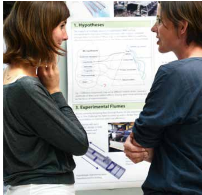
Eawag promotes a collaborative research environment with an emphasis on interdisciplinary and transdisciplinary research.