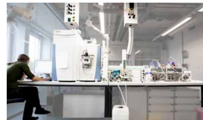
Advanced analytical instrumentation is available for organic, inorganic and isotopic analysis as well as proteomics and molecular biology.