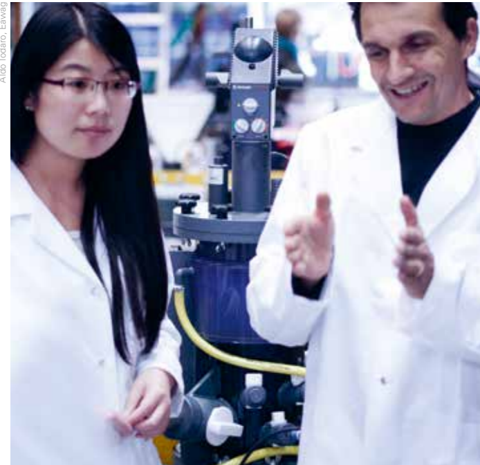
Our staff includes people from over 35 different countries.

The tenure evaluation period at Eawag is 5 years. The initial contract is for 2 years with a 3-month probation period. After the probation period, each tenure-track researcher meets with the Director for an informal "0 th " career discussion. This is an opportunity to clarify the tenure process and expectations and to answer questions. Annually, the tenure-track researcher has a personnel discussion to review his or her progress and set goals for the coming year with his or her Department Head and one member of the Directorate, who attends in the capacity of coach for the Department. After 1.5 years, the tenure-track researcher has a formal 1 st career discussion with the Director to provide input for the Directorate's discussion on the re-appointment. If the re-appointment is approved, the tenure-track researcher's contract is extended for an additional 3 years. The candidate must submit his or her tenure package approximately 5 months before the end of the contract.