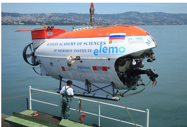
Fig. 1 MIR submersible from the PP Shirshov Institute of Oceanography, Moscow, of the Russian Academy of Sciences, ready to be launched in Vidy Bay, Lake Geneva, Switzerland. The submersible is driven by the large black propeller (left) and its 3-D trajectory is controlled by two small white propellers (center one on each side). Details of the equipment visible in front of the submersible (right) are given in Fig. 3.

Consequently, the opportunity of a lifetime was presented when the Consulat Honoraire de la Fédération de Russie, proposed to the Ecole Polytechnique Fédérale de Lausanne (EPFL) to bring the two world's most famous MIR submersibles to Lake Geneva (Fig. 1). The PP Shirshov Institute of Oceanography in Moscow, owner of the MIRs and the Fondation pour l'Etude des Eaux du Léman (FEEL) in Lausanne, agreed that the MIRs would make a total of 60 scientific dives in Lake Geneva from 14 June to 24 August 2011. The generous sponsoring by the Consulat Honoraire de la Fédération de Russie and the FEEL foundation allowed initiating and supporting the project elemo ( http://www.elemo.ch ) in order to take advantage of this unique opportunity. The emphasis was put on studies