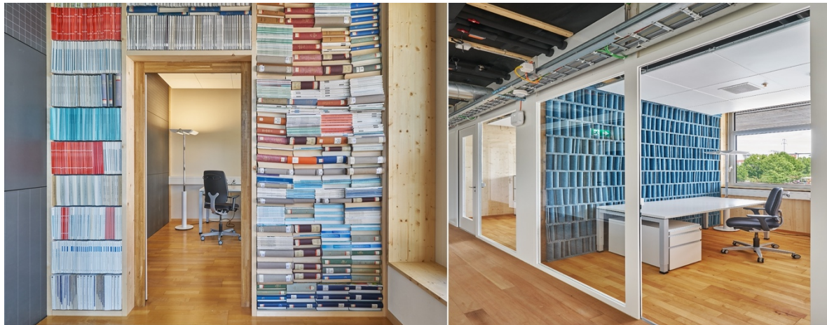
Figure 1. Temporary walls with books (on the left) and carpet tiles (on the right) in the Sprint unit.

From the point of view sustainability assessment, this transition to a circular construction practice creates the need for novel approaches for Life Cycle Assessment (LCA) that are able to take into account the multiple lifecycles and the circular flows of materials in a fair and transparent manner. Then today, conventional LCA approaches are not delivering credible results in such situations. In fact, they are conceptualized to assess the impacts of building products or buildings of a single life cycle only [5], whereas CE-oriented LCA needs to take into account multiple cycles of materials and products due to the recovery, repair, refurbishing, recycling and/or reuse activities occurring within a circular economy [6], resulting in cascading systems. Main challenge in such cascading systems is the allocation of credits and burdens between the various life cycles that share a specific material and the precariousness surrounding the actual occurrence of the next use-cycles of materials into the distant future, despite the fact that these cycles were planned to occur [7]. Currently, there is no universally accepted allocation approach for such studies [8].