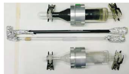
Fig. 2. Glass sampling devices exposed to 7 m 3 exhausts of a heavy duty engine (3 min operation) with and without filter.

filters, exposed to 7 m 3 exhaust (3 min operation) of a heavy duty engine (6.1 L). A VERT-approved diesel particle filter was used in one case. The other sample represents untreated heavy duty vehicle exhaust (94% of the Swiss HDV fleet).