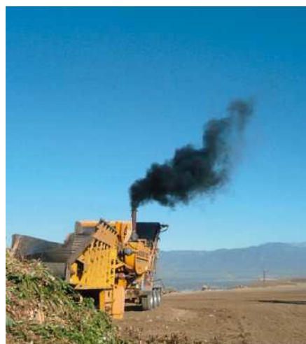
Fig. 1. Construction machinery in Switzerland has to be equipped with filters since 2009, but most trucks on roads are not.

The endeavor 'NEAT' (Neue Alpentransversale, the new transalpine rail link) triggered various activities, among them the VERT project (Verminderung der Emissionen von Realmaschinen im Tunnelbau) – a joint effort from SUVA, BAFU, filter and catalyst manufacturers, TTM, and EMPA – to evaluate suitable filter technology for construction machinery to fulfill air quality standards in these long tunnels (Fig. 1).