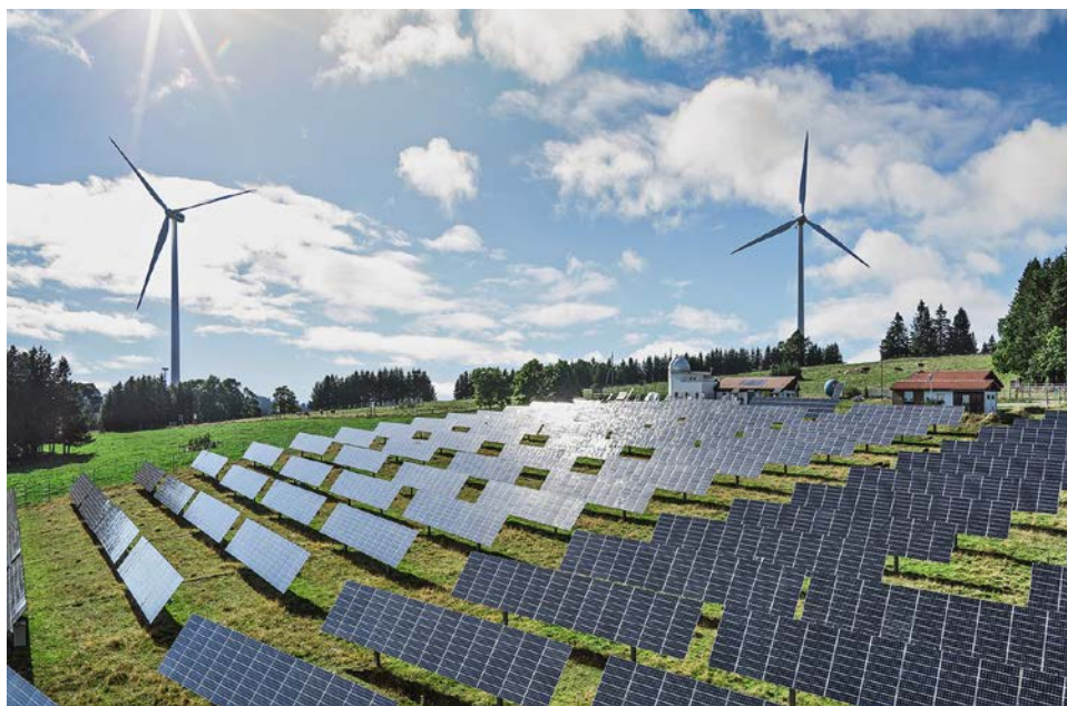
Energy of the future, or wasted land and a blight on the landscape? Opinions differ on wind and solar power plants – including the oldest solar energy plant in Europe, which was built on an alpine field on Mont-Soleil (Canton Bern).

sun and water resources are actually sufficient. To this end, WSL and Eawag launched the Energy Change Impact research program in 2014. The ETH Board granted it CHF 1.5 million from the energy research budget in the period up to 2016.