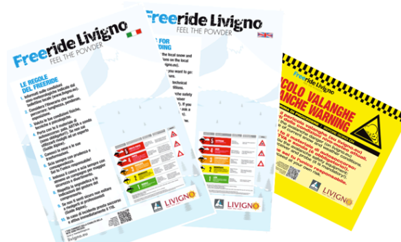
Fig. 4: Example of signs related to the Livigno Freeride project. The communication style is uniform and integrated.

Within the first three years, all the old signs spread in the municipality area and in the ski-resorts regarding avalanche risk will be replaced by a uniform and integrated communication (Fig. 4).