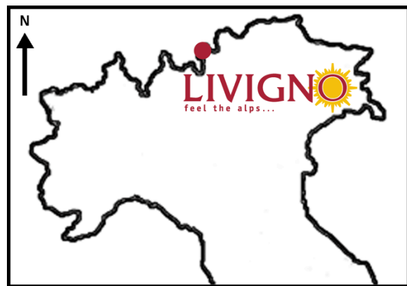
Fig. 1: The Livigno municipality is located in the middle of the Italian alpine range, at the boarder with Switzerland and South Tyrol at 1816 m a.s.l..

The interest in off-piste / backcountry snow sports had gained popularity in the last 10 to 20 years. Thus, lately, managing and promoting these kind of activities became important and strategic for tourism in Livigno. In Italy practicing activities out of the managed areas in terms of avalanche risk is complicated due to several factors: i) The legislation treats skier-triggered avalanches as a crime; ii) Ski resorts are only responsible for ski slopes and lift safety, thus they are not organized with snow-patrollers for managing the nearby areas;