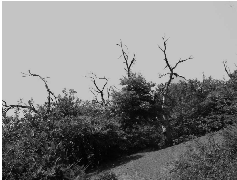
European chestnut forest. Some trees were killed by virulent Cryphonectria parasitica strains, but most trees were healthy. They were infected with virus-infected C. parasitica strains.

Associate Editor: Jukka Jokela Editor: Judith L. Bronstein