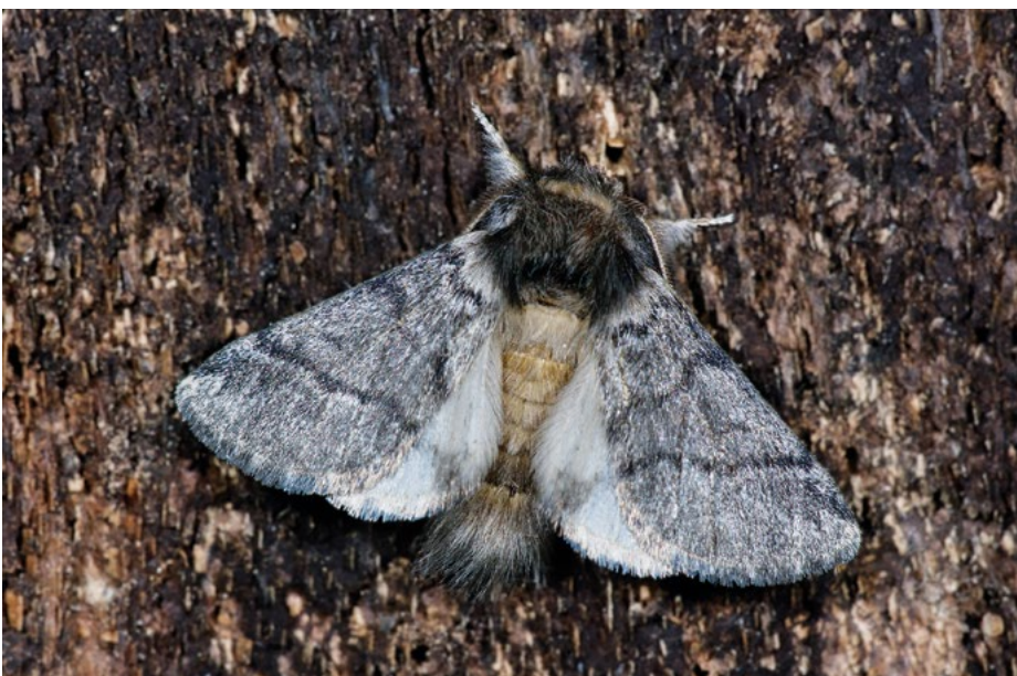
Fig. 2. Adult male oak processionary moth.