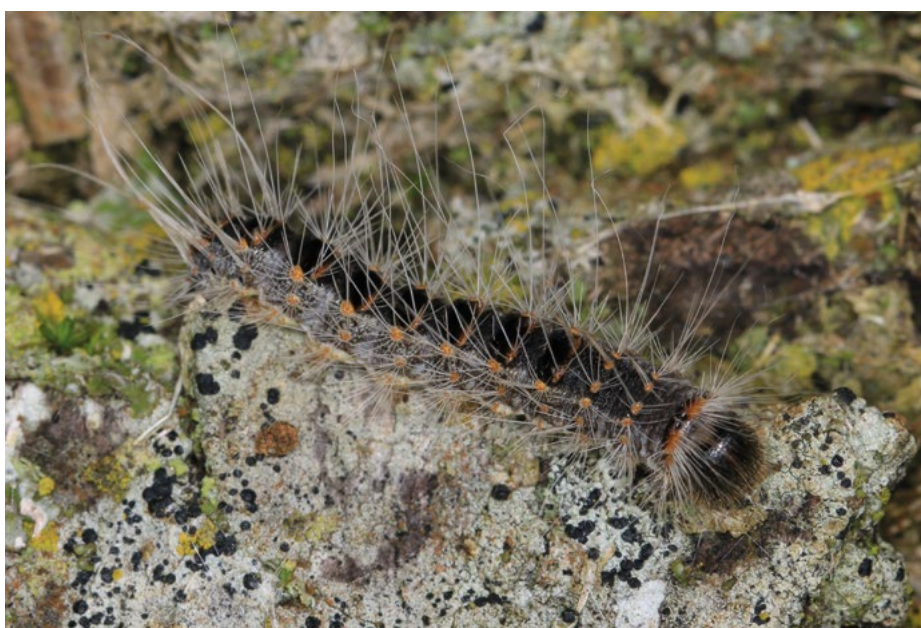
Fig. 7. Older caterpillar of the oak processionary moth.