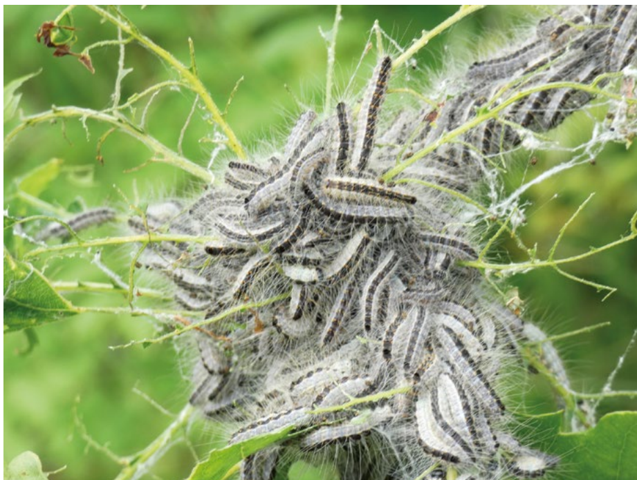
Fig. 6. Larvae of the oak processionary moth in 4th instar, stripping oak leaves as they feed.

The preferred host plants of the oak processionary moth are the common or pedunculate oak ( Q. robur ), the sessile oak ( Q. petraea ), the downy oak ( Q. pubescens ), the Pyrenean oak ( Q. pyrenaica ) and the Turkey oak or Austrian oak ( Q. cerris ; BATTISTI et al. 2014). T. processionea has also occasionally been observed on other broad-leaved deciduous tree species such as birch ( Betula spp.), beech ( Fagus spp.), sorbus ( Sorbus spp.), robinia ( Robinia spp.) and hawthorn ( Crataegus spp.; BATTISTI et al. 2014). However, its development cycle can only be completed successfully on oak and beech (STIGTER et al. 1997).