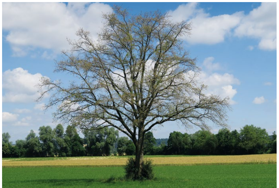
Fig. 9. Oak trees ( Quercus spp.) defoliated by the oak processionary moth.

reserves impairs the formation of earlywood and latewood vessels in the following years, which can lead to a physiologically induced water deficiency of the trees even in soils with a sufficient water supply (THOMAS et al. 2002). While oaks usually survive a single defoliation without problems, repeated defoliation can significantly weaken the vigour of the host plants, which also increases the susceptibility of the trees to other stress factors, such as secondary pests and pathogens as well as drought or frost (BATTISTI et al. 2014; LOBINGER 2013).