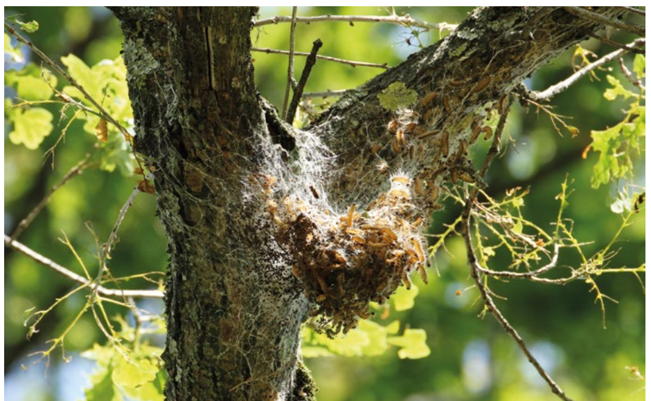
Fig. 4. Densely woven silken nests of the oak processionary moth on oaks.