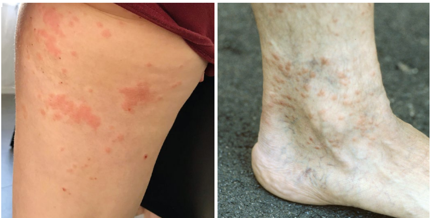
Fig. 10. Allergic skin reactions caused by the stinging hairs of the oak processionary moth.

In Swiss forests, the risk to health posed by oak processionary moth infest-