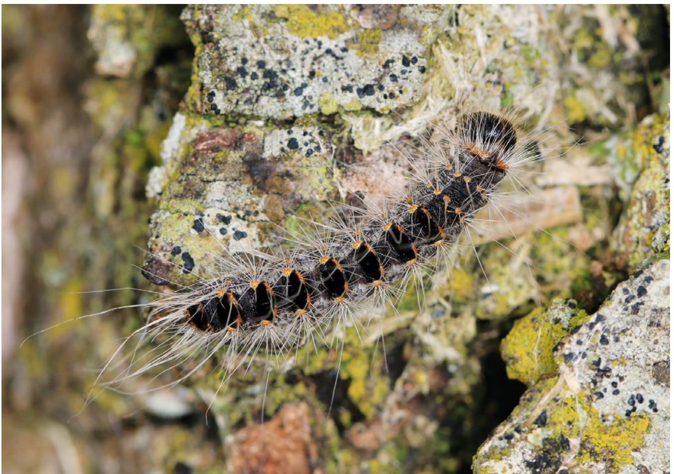
Caterpillar of the oak processionary moth ( Thaumetopoea processionea [L.]).

the leaves of oak trees, and large populations can lead to the complete defoliation of infested trees. The oak processionary moth attracts particular attention because the urticating (stinging) hairs of its caterpillars can cause allergic reactions in humans and animals.