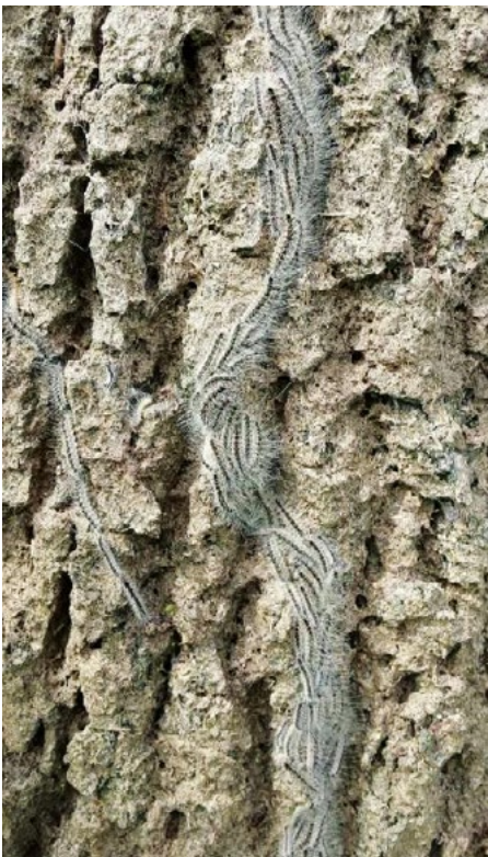
Fig. 5. Head-to-toe, several abreast: a procession of oak processionary caterpillars.