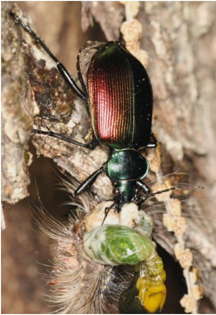
Fig. 8. A forest caterpillar hunter ( Calosoma sycophanta ) feeding on a butterfly caterpillar.

Among vertebrates, bats are known to be natural enemies, as well as birds, including the cuckoo ( Cuculus canorus ) and tits (Paridae), for example (SOBCZYK 2014). Pathogenic microorganisms associated with the oak processionary moth are the bacterium Bacillus thuringiensis , various microsporidian species (HOCH et al. 2008) and a virus (VAGO and VASILJEVIC 1955). However, their impact on the population dynamics of the insects is still largely unknown.